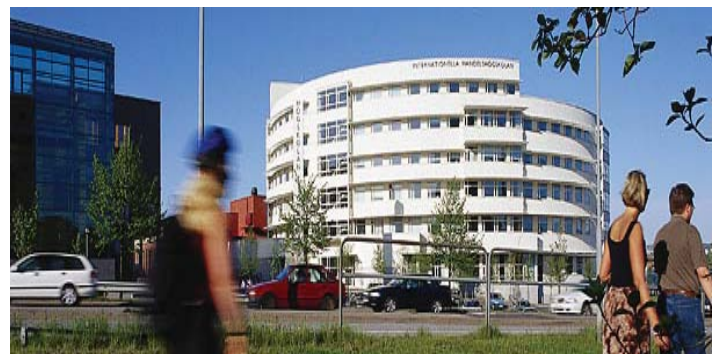
Jönköping International Business School

was developed, although I haven't had any huge urges to visit the Match Museum. It is at the base of the second-largest lake in Sweden. It is about 90 minutes North of the famed Crystal Kingdom (definitely worth the trip). Our winter to date has been very much milder than the winters many of you are experiencing. The town is equally inconvenient to both Stockholm and Copenhagen, being two trains and about three hours to either. It is quite a feat to make an international flight from either of those cities on the same day as you start out. For internal European trips, we leave