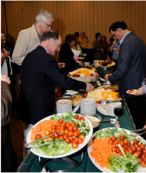
(below) Conference attendees at the opening reception