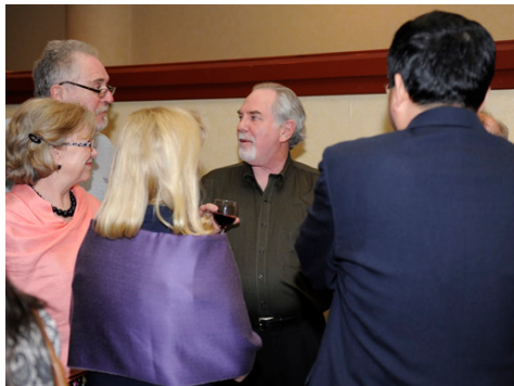
Crowd at the reception honoring the four retiring members