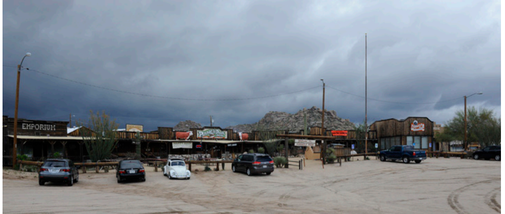
(right) Pinnacle Peak, the venue of this year's social event