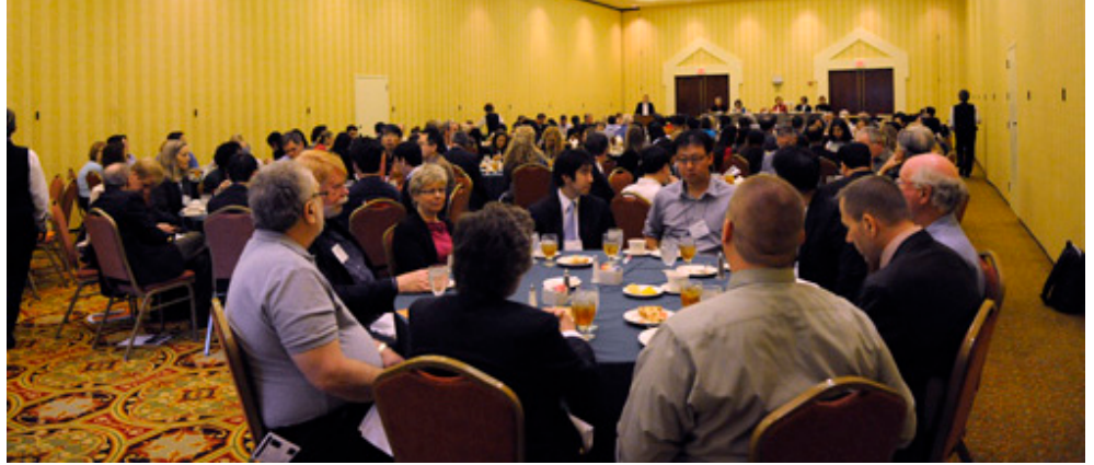
(above & right) Conference attendees at the Award Luncheon