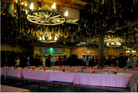
(above) Inside of the Pinnacle Peak restaurant