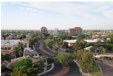
(below) View of the surrounding area of the conference hotel