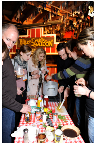
Four teams led by different past AAA presidents participated in the chili cooking competition