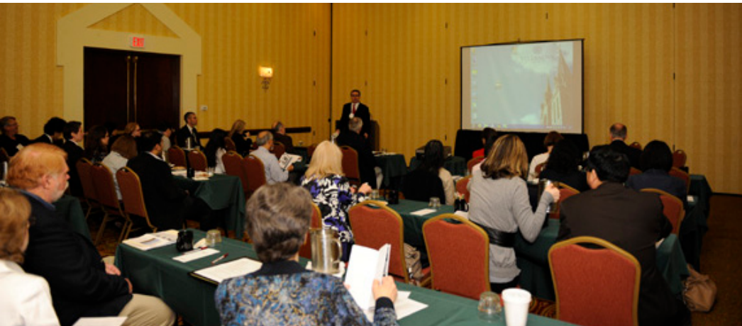
(above) Pre-conference session participants

Pre-Conference Sessions – Junior Faculty and Doctoral Student Consortium & Integrated Marketing Communication